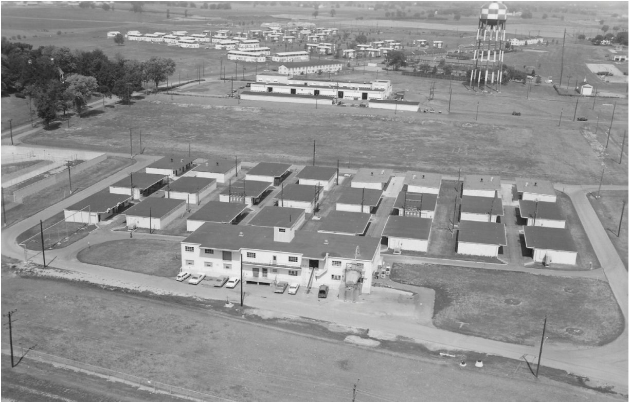
An aerial view of the Animal Farm division at Fort Detrick.